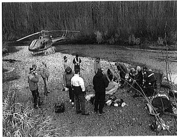
Bella Coola Airport Emergency Exercise