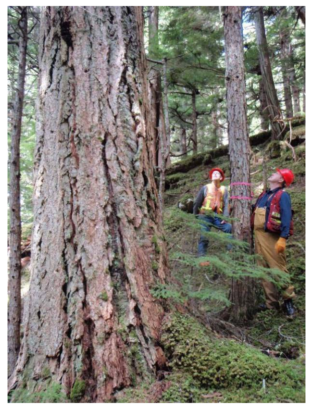
Nusatsum Valley