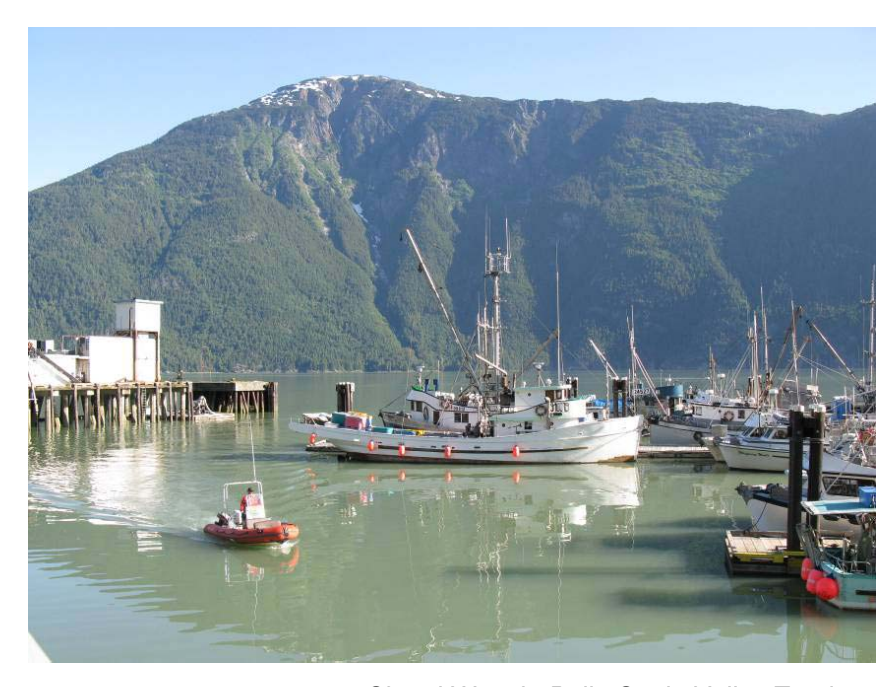
Cheryl Waugh, Bella Coola Valley Tourism